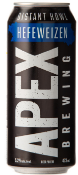
Apex Brewing Distant Howl Hefeweizen Alberta, Canada $16-18 (4-pack cans) CSPC 869571