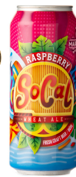
Marda Loop Raspberry SoCal Wheat Ale Alberta, Canada $18-19 (4-pack cans) CSPC 861132