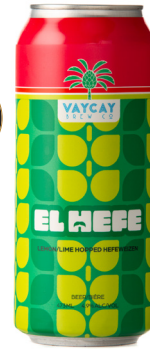
Vaycay Brew Co El Hefe Dry Hopped Hefeweizen Alberta, Canada $18-20 (4-pack cans) CSPC 886513