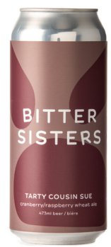
Bitter Sisters Tarty Cousin Sue Cran/Raspberry Wheat Alberta, Canada $17-18 (4-pack cans) CSPC 843731