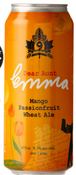
Buffalo 9 Brewing Dear Aunt Emma Mango Passionfruit Wheat Ale Alberta, Canada $18-19 (4-pack cans) CSPC 872869