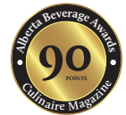
THE ESTABLISHMENT BREWING COMPANY MY BEST FRIEND'S GIRL Alberta, Canada $18-19 (4-pack cans) CSPC 818449